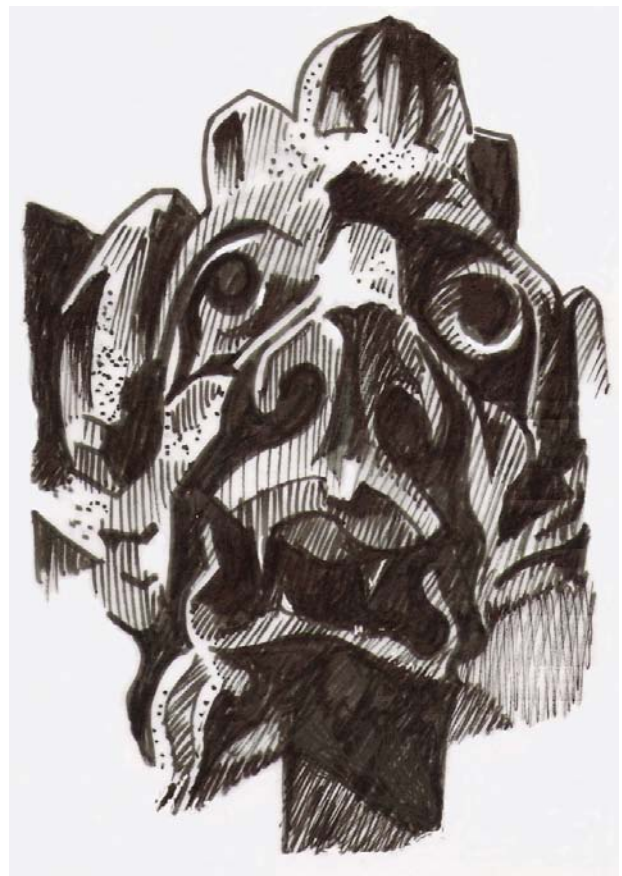
An 1847 grotesque stone head on the bell-cote at Ellerton

Leeds chamber choir Cantabile returns to Ellerton this Summer with a rich and stylish trans-Atlantic programme. Old York to New York is bursting with three centuries of music from Britain and the Americas - from spirituals to the blues, folk-tunes to show-tunes, Purcell to Tin Pan Alley. Cantabile has promised us a glorious morsel by Benjamin Britten (a truly great 20 th century musician, in his centenary year), haunting miniatures by Purcell, inspiring little masterpieces by Sir Hubert Parry (best known for Jerusalem ), thrilling arrangements of well-known African-American spirituals elegantly contrasted with humble and moving folksongs, and even some sultry, smoochy popular ballads from Hollywood and Buenos Aires. And there may be a surprise instrumental soloist! Tickets are £7.00 each (£3.50 for children and the disabled), available on the door or reserved in advance at yorkbear@hotmail.co.uk or on 01904 630097. Refreshments are included in the ticket price, including crisp Summer afternoon wine, soft drinks, and tea and coffee.